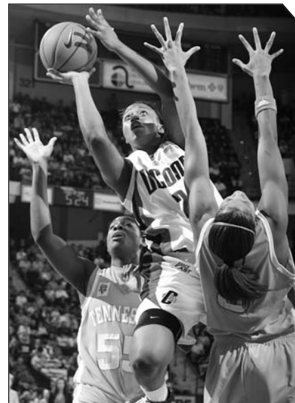
2007-08 will mark the first season in which UConn does not meet Tennessee in the regular season since the start of the series in 1995.

* - Opponents are listed under conference in which it was a member of when it faced UConn at the time of the game.