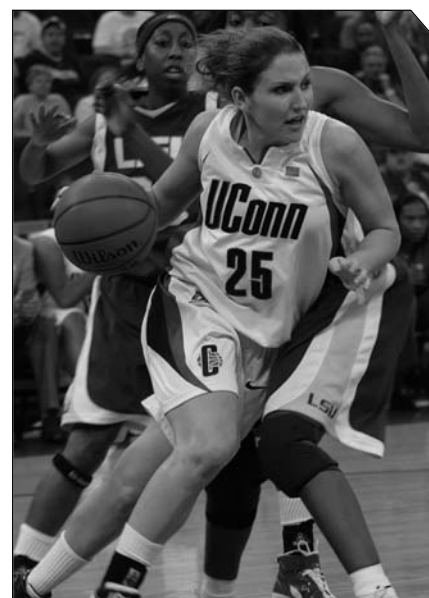
UConn and LSU will meet for the third straight season.