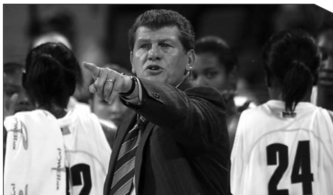
HEAD COACH GENO AURIEMMA (1985-PRESENT)